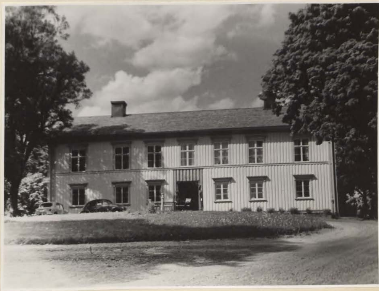
Kommunsalhuset, inrymd i Karlbergs herrgård